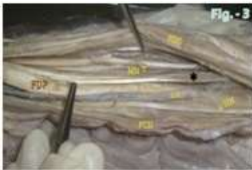
Figure 3: Showing the relations of Gantzer's muscle to the median nerve and ulnar artery in the right upper limb.

require surgical excision 9 . Vasavi Rakesh G et al 4 reported the origin of two accessory bellies from the undersurface of the flexor digitorum superficialis muscle inserting into two deep flexors of the forearm (FDP and FPL). Binod Kumar Tamang et al 10 observed that the accessory head of flexor pollicis longus was present in 13(43.3%) cadavers arising from FDS (common origin). Soubhagya R. Nayak et al 6 observed the triple gantzer's muscle having common origin from the under cover of the FDS fibers and by fibrous band above the insertion of brachialis and inserting into FDP, FDS and FPL.