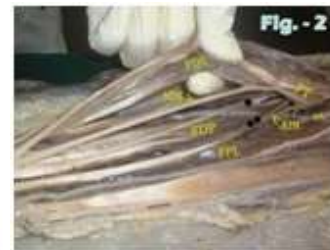
Figure 2: Showing the relations of Gantzer's muscle-bellies to the median nerve, anterior interosseous nerve and ulnar artery in the left upper limb

FDS - Flexor Digitorum Superficialis; PT- Pronator Teres; * - Gantzer's Muscle inserted to FDP; ** - Gantzer's Muscle inserted to the FPL; MN - Median Nerve; AIN - Anterior Interosseous Nerve; UA - Ulnar Artery.