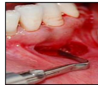
Figure 5: Initial bonecut with UBS device

A horizontal linear incision was made from lower right canine to lower left canine just apical to the mucogingival junction. The mucosa and mentalis muscle were lifted from the bone using a periosteal elevator. The lower border of the mandible was identified and the mentalis was reflected to just short of the lower border in order to avoid 'witches chin' which is a possible complication of this technique 12 . The apices of the lower incisors were identified and the initial cut into the bone was made 5mm below to the apices of the incisors with the help of piezosurgery device 11,12 (figure 5).