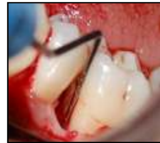
Figure 4: Probing the defect-5mm

graft that was necessary. Thorough degranulation and SRP was done. After probing 5 mm bone defect was seen (figure 4).