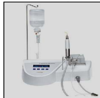
Figure 1: Piezosurgery device

lateralization and transpositioning 7 . This device was invented by Dr. Tomaso Vercellotti, designed to cut or grind the bone but not damage the adjacent soft tissue and with the purpose of securing improved precision and safety in bone harvesting and other bone surgeries compared with the manual and rotary instruments. The mechanism of this device is based on the 'Piezo effect' first described by French physicists Jean and Marie Curie in 1880 8 .