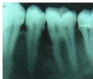
Figure 3: Preoperative IOPA showing angular defect between 35, 36 region

A pre-operative dental panoramic tomograph was taken to confirm adequacy of mental bone apical to the roots of the patient's lower incisors to harvest intraoral autogenous bone graft. There is a chance of an increased incidence of altered sensation of lower incisors after harvesting bone graft from symphyseal region 11 . The same was explained to the patient and consent was taken.