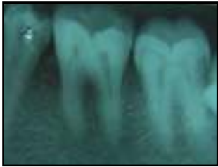
Figure 7: 9 months post-operative IOPA showing bone fill.

The chin wound was sutured in two layers with a 5/0 resorbable suture. First the mentalis was sutured with internal interrupted sutures and then the overlying mucosa was closed.